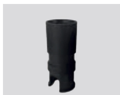
MTY.CM000000.00 Cassaforma mini / micro Tebe

MTY.CM000000.00 Mini / Micro Tebe recessed box