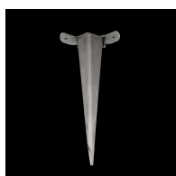
LAA.SP00.000.00 Picchetto Inox

AAA.TRSL13.00 Driver LED constant voltage 24V 70W IP67.