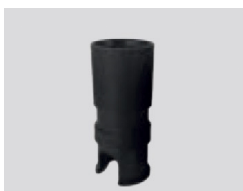
MTY.CM000000.00 Cassaforma mini / micro Tebe

MTY.CM000000.00 Mini / Micro Tebe recessed box