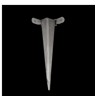
LAA.SP00.000.00 Picchetto Inox

AAA.TRSL13.00 Driver LED constant voltage 24V 70W IP67.