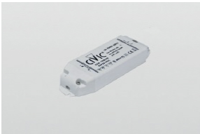
AAA.TRSL08.00 Driver LED tensione costante 24V 30W