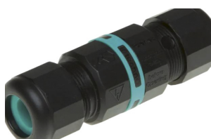
AAA.CN2000.00 Connettore IP68, 2 vie.

AAA.CN2000.00 IP68 waterproof connector, 2 ways.