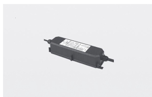
AAA.TRSL13.00 Driver LED 24V 70W IP67

AAA.TRSL08.00 Driver LED constant voltage 24V 30W.