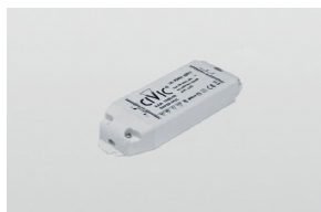
AAA.TRSL08.00 Driver LED tensione costante 24V 30W

AAA.CN2000.00 IP68 waterproof connector, 2 ways.