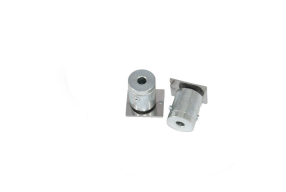
TNI.DP0000.00 T-Uni attacco a plafone (coppia)

TNI.CD0000.02 Linear joint for one-lamp versions. White.