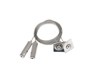
TNI.SO0000.00 T-Uni Kit di sospensione (coppia) per modello monolampada

TNI.DP0000.00 T-Uni ceiling mount (pair).