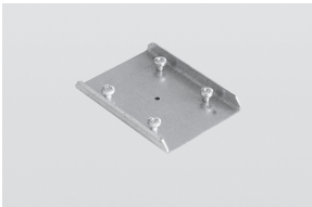
TNI.CD0000.02 T-Uni Giunto Lineare per modello monolampada

TNI.CD0000.02 Linear joint for one-lamp versions. White.