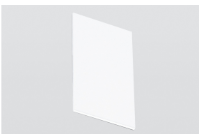
TNI.TE0000.02 T-Uni testata per modello monoemissione bianca

TNI.SO0000.00 T-Uni suspension kit (pair) for one lamp version.